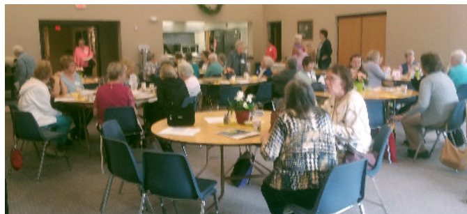
Arrowhead I event on May 4th in Esko, MN