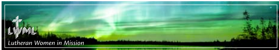
"Serve the Lord with Gladness..." Psalm 100:2