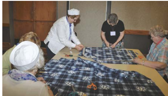
Servant Event: tying Linus blankets 35 women made 34 blankets