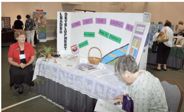
Exhibits and sales booths - lots to see and learn!