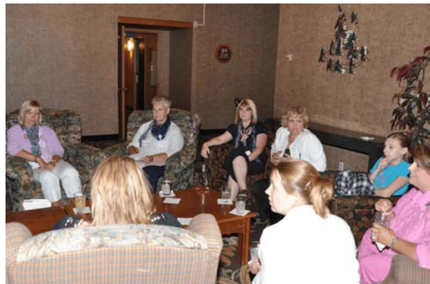
YWR fellowship at the Rafters