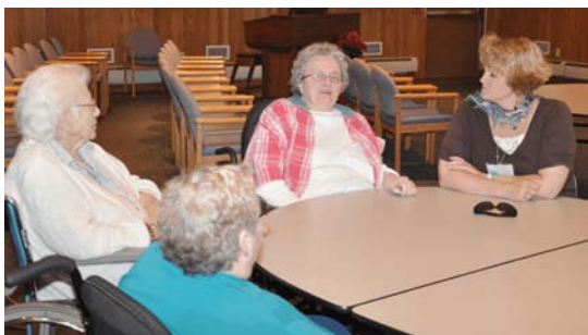
YWRs visit Bethany Nursing Home