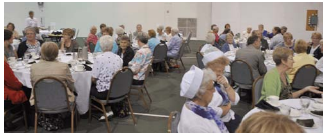
Tuesday banquet and entertainment