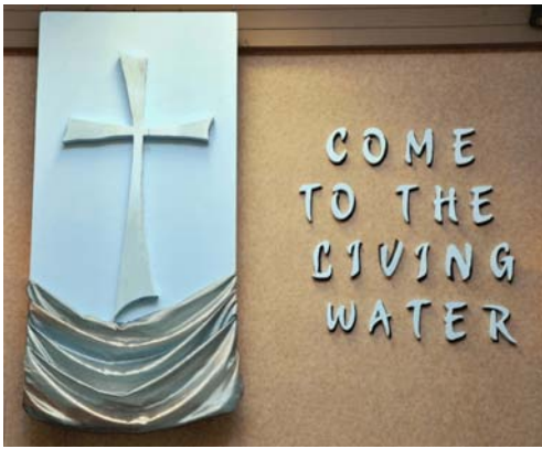
24 th Biennial Convention Minnesota North District LWML