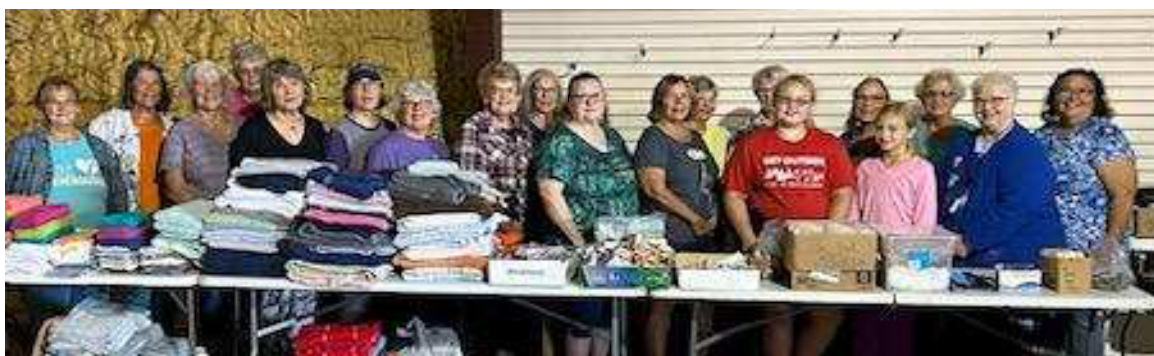
Packing the Health Kits

May you and your gifts in the name of Christ Jesus be the cause of much “Thanks and Praise” to Christ, our Savior.