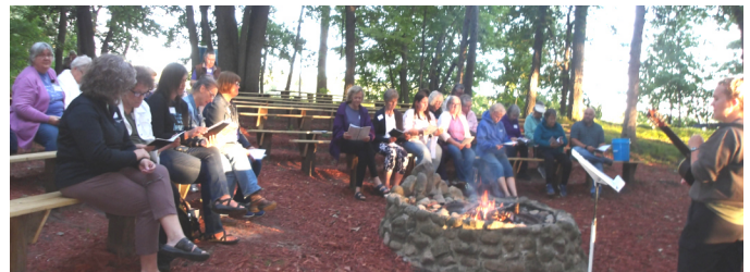
Singing Around the Campfire