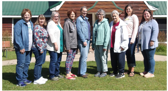
First Time Attendees