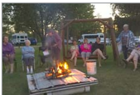
Relaxing by the fire.