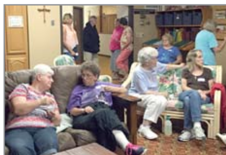
Catching up with friends.