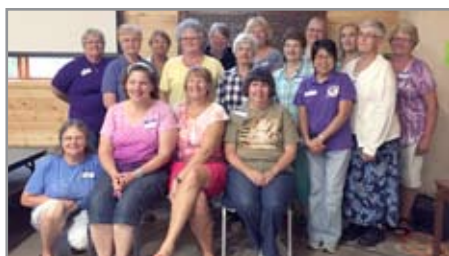
17 first-timers attending the retreat!

Saint Paul, in Philippians 4:10-20, thanked the Philippian church for the support they rendered to him on one of his journeys. He welcomed their support – was it prayers, money, goods – we are not told. He called it an acceptable sacrifice, pleasing to God. May we do the same with our quilts, diapers and other items we make and use locally or send off to other places.