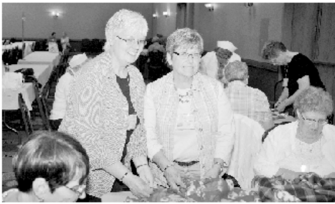
Servant Events brought 35 ladies to tie 34 Linus blankets.