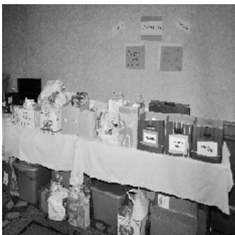
Thank you for bringing these donations to the convention!

Stamps for Missions were received. Money raised by auctioning postage stamps to collectors goes towards our Mission Grants. Over 12 ½ pounds collected!