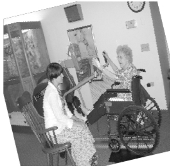
Bethany Community nursing home visit