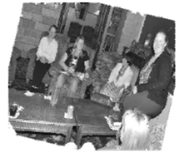
Pizza Party in the Rafters Room