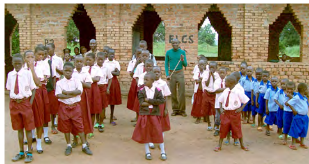
Teachers and some of the students of the Yambio school. The uniforms were provided by the St. John's Sunday school, Ottertail.