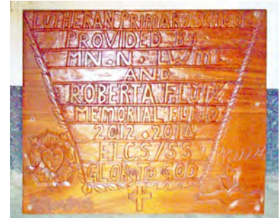
Mahogany plaque which reads: Lutheran Primary School Provided by MN. N. LWML and Roberta F. Lutz Memorial Fund 2012-2014 ELCS/SS Glory to God.

As the school develops, more of the area children will begin attending. There are presently about 150 students and six trained teachers. The LWML Minnesota North District has been a Godsend to the school and the Church at large! I truly appreciate the district being an important part of mission work in South Sudan.